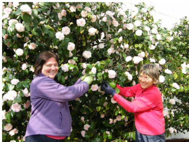
Volunteers tending the camellias

The festival was made possible by our team of volunteer Conservatory Stewards who did a magnificent job welcoming and guiding the public, selling tickets and staffing our small shop where camellia plants supplied by Trehane's, the UK's leading Camellia growers, were quickly snapped up. The proceeds from the festival all go to support the upkeep of the gardens and the festival is set to become an annual feature in the national gardening calendar.