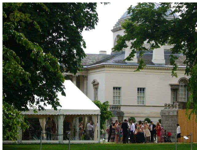
The Burlington Pavilion

Providing a sustainable future for the house and gardens is a key aim and reason for the foundation of the Trust; weddings, corporate functions and family celebrations in the House, Burlington Pavilion, Cafe and newly restored Conservatory bring in a much needed income as well as providing an unrivalled setting for people's special event. Happily bookings for 2011 are already strong. Using the gardens for film and selective advertising is another aspect of our activities and many readers may have spotted a recent example featuring the café building and a certain make of shoes!