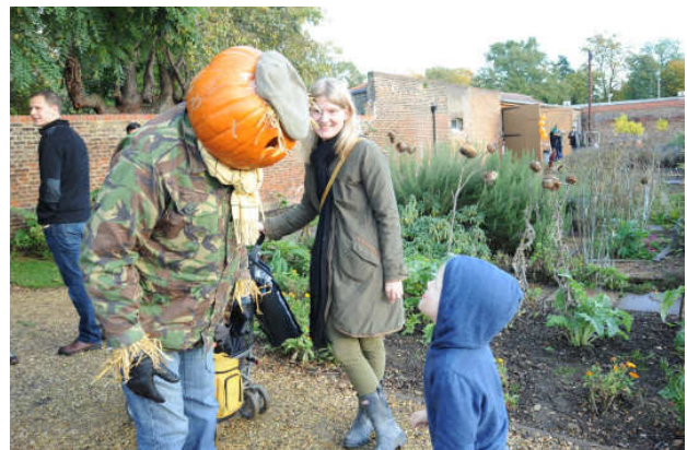
Activity in the Walled Garden

Elsewhere in the garden April's drifts of daffodils and Lenten roses will soon give way to early summer flowers. The Rosary and Italian Garden will be a picture in June. The walled gardens are being transformed by the Community Kitchen Garden Project, which is attracting large numbers of volunteers and school groups learning to 'grow to eat' vegetables and soft fruits. Their work is showcased at regular open days and events like the Family Pumpkin Party.