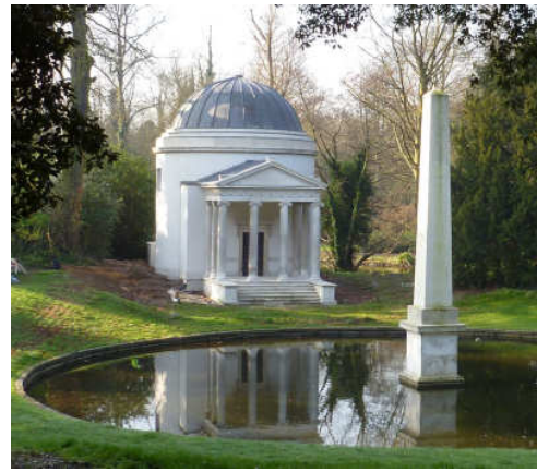
The Ionic Temple with its restored roof