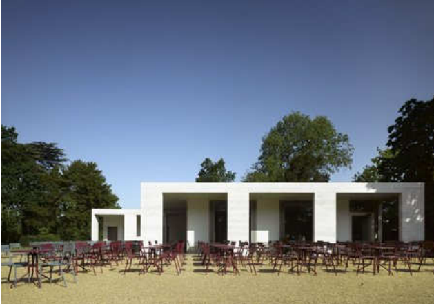
The award-winning cafe

We are delighted to receive two prestigious awards this year. Firstly, Chiswick House Café, designed by architects Caruso St. John, received a Civic Trust Award for its outstanding contribution to the quality and appearance of the environment. Judges said, 'The excellent, robust architecture provides a contemporary reinterpretation of classical principles' and described the building as 'enigmatic and timeless'.