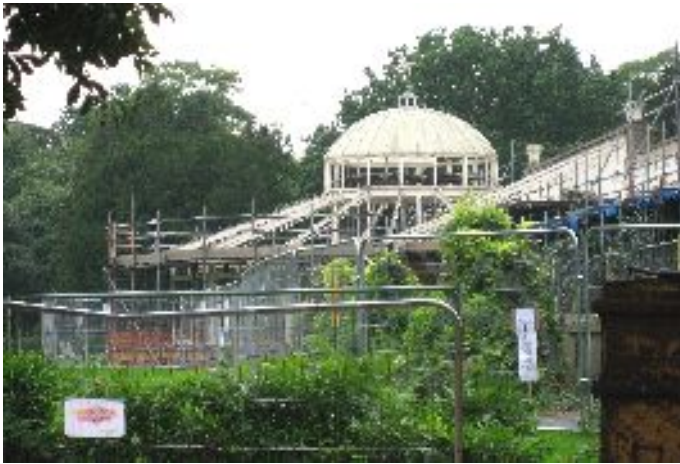
Dismantling the Camellia House

As many readers will be aware the Chiswick House Restoration Project is now well underway with works happening across the park. Fencing, ditches, diggers, hard hats and yellow jackets greet regular visitors at every turn, and the Trust is immensely grateful for their patience in negotiating a plethora of diversions! The refreshment kiosk by the cricket pavilion has attracted a regular trade whilst the new cafe building is constructed and the adjacent lavatories at Staveley Road gates have been brought back into public use.