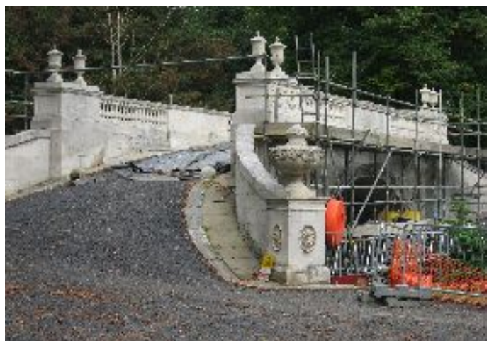
Repairs and access improvements for the Classic Bridge

As well as the tree works identified in the Heritage Lottery Fund project, additional works are required both to prolong the lives of mature and veteran trees and to prevent accidents from falling branches. An independent arboricultural survey has identified a number of urgent tree works that will commence this autumn. These include pollarding the large plane tree in the Camellia Shrubbery, which has a huge cavity where the branches divide from the trunk.