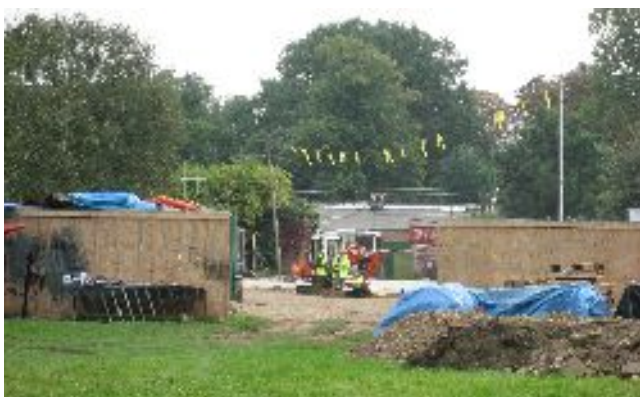
Landscape contractor UPM Tilhill's base by the Hockey