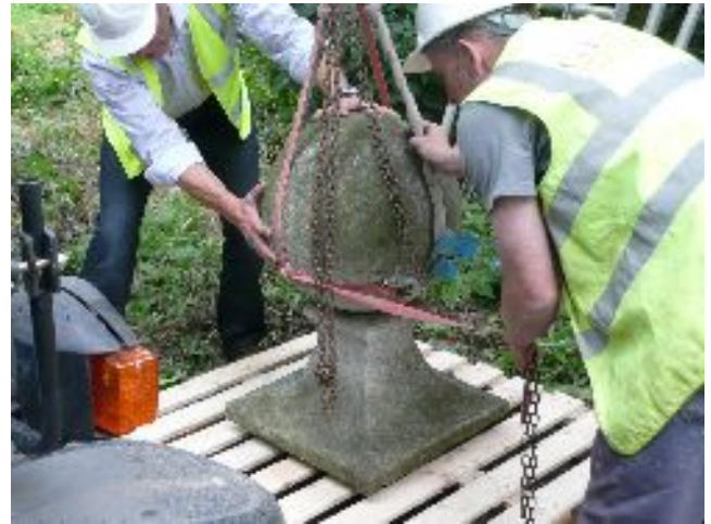
Careful handling of the gate-post masonry

The Trust have erected large plans of the restoration works on new signs at every entrance to the park as well as more detailed posters positioned at specific works areas. The excellent exhibition on Chiswick House and Gardens at North Lodge, which was generously supported by The Friends, is also being reproduced for display on the back railings of the Villa. Further information is available on the Trust's web site, www.chgt.org.uk , in particular in the new monthly newsletter slot.