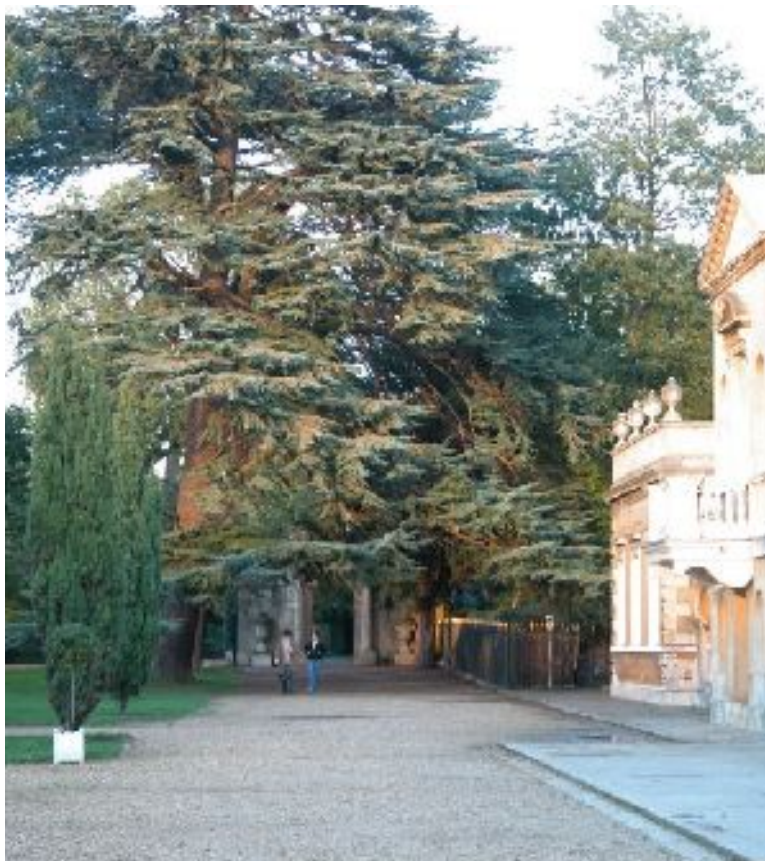
An all too rare fine evening this summer