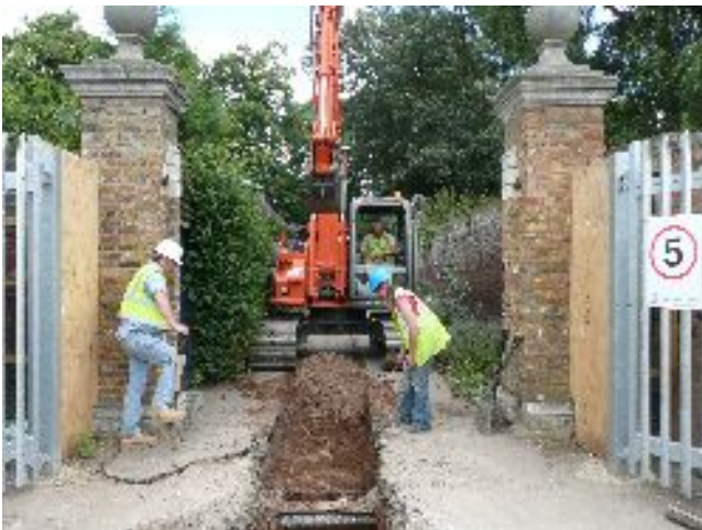
Trenching for service pipes and cables in the yard