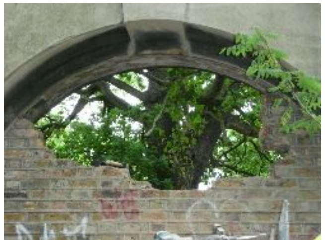
Opening up the rustic arch by the tennis courts