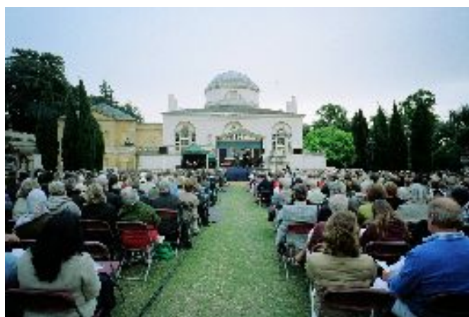
This year's opera in June