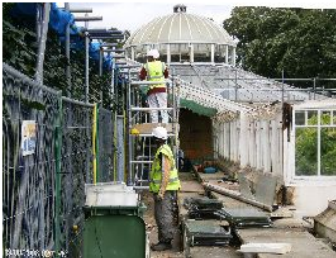
Camellias protected (left in the picture)