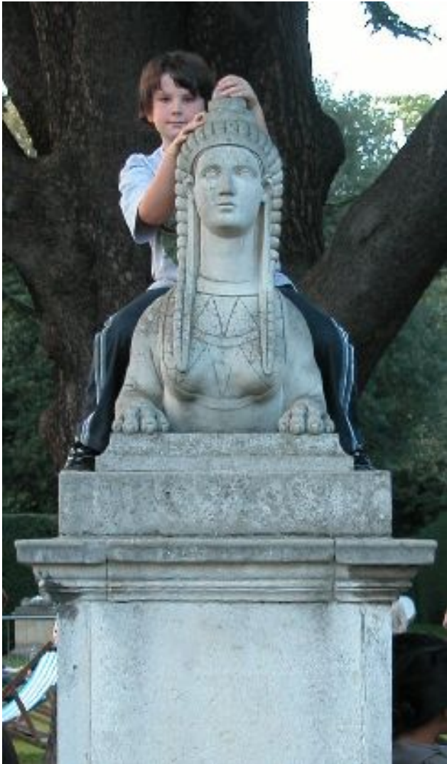
The Gardens are an informal place!

This year's Dog Show will take place on 28 th September starting at 10.30am (Staveley Road entrance).