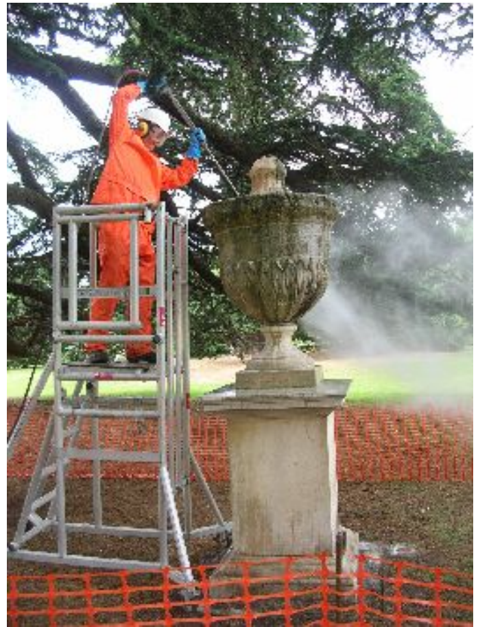
Contractors cleaning layers of grime off the statuary

Perhaps the most visually dramatic restoration currently underway is that of the Camellia House. Visitors to the Italian Garden can see the complete dismantling of the ruinous glazed structure, including the dome. Every piece of wrought iron has been carefully labelled and transported to Barnsley for specialist restoration. Next year our specialist contractors Walter Lilly & Co will reassemble the jigsaw with new glazing and replacement timber. In the meantime the historic camellia collection has been deliberately exposed to the elements so that it acclimatises prior to winter frosts. The plants are looking exceptionally healthy and are well protected from the construction works.