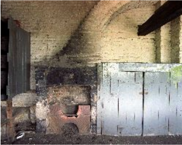
Relics of 19 th century gardening in the back sheds